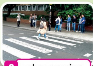
2 zebra crossing