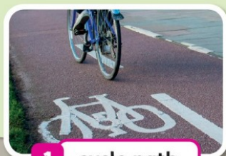
1 cycle path