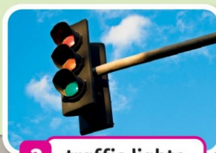
3 traffic lights